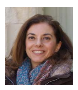
Dear colleagues, Dear students,

It is with great pleasure that I welcome you to Brussels for the first 2013 edition of the European Study Tour.