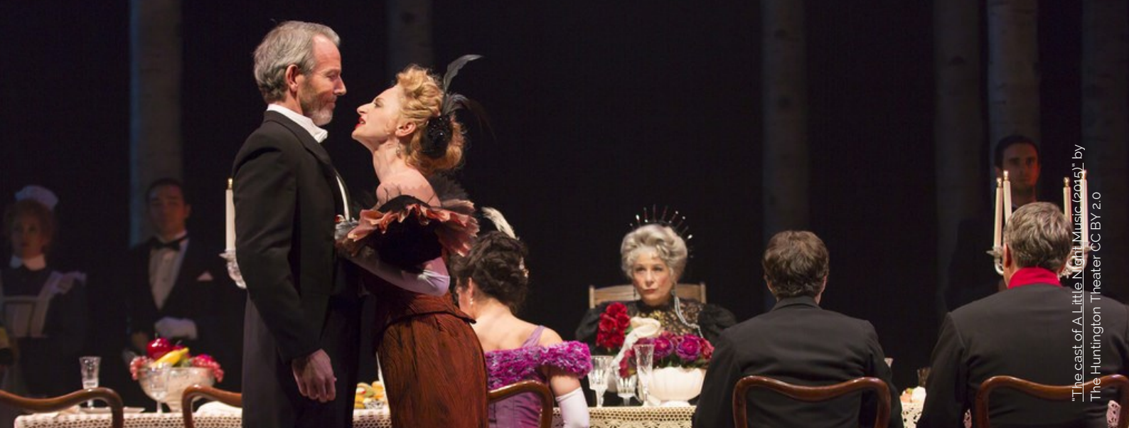
“The cast of A Little Night Music (2015)” by The Huntington Theater CC BY 2.0