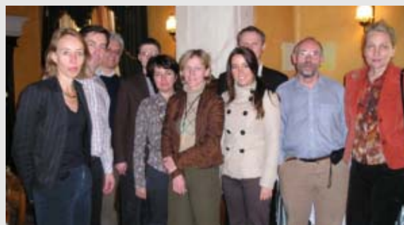
The partners during the meeting in Krakow

...that arts managers carry out an essential function in facilitating and inspiring creative and cultural activities among all sectors of society.